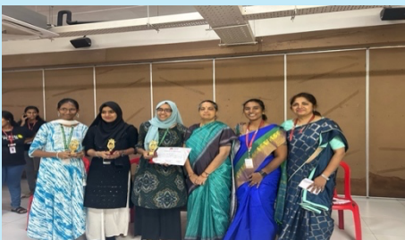
Kshitij- Intercollegiate language fest