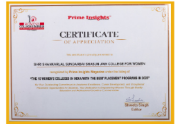
Prime Insights Magazine Private Limited Certified Our Institution The 10 Women's Colleges in India with "The Best Placement Programs in 2025"